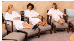
VITALITY AT SEA SPA AND FITNESS CENTER